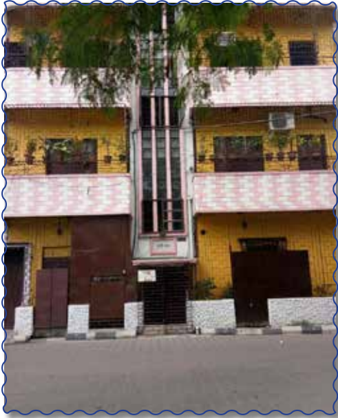
A new beginning in our new centre, 58/23 Prince Anwar Shah Road, Kolkata 700045

The year gone by has been a happening year for weCan. Lots of new beginnings, with so much excitement and enthusiasm and most importantly a belief in ourselves.